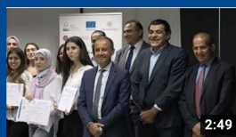
YEP MED News : Lebanon: First group of students graduates