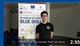
YEP MED Storytellers Italy: Reflections on the YEP MED course