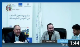
YEP MED News Jordan: First group of students graduates